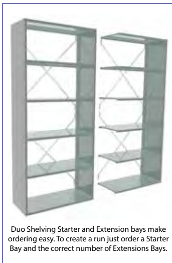
Duo Shelving Starter and Extension bays make ordering easy. To create a run just order a Starter Bay and the correct number of Extensions Bays.