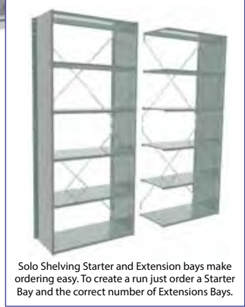
Solo Shelving Starter and Extension bays make ordering easy. To create a run just order a Starter Bay and the correct number of Extensions Bays.

Cost effective fully adjustable single skin upright shelving system. Stormor Solo uprights are manufactured from one-piece steel and feature a delta front edge with no sharp edges, so eliminating snagging when loading shelves.