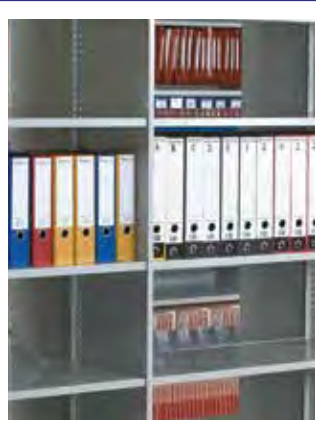
Slim 20mm profile uprights combine with 25mm section shelves to be aesthetically pleasing and maximise available storage space.

Cost effective fully adjustable single skin upright shelving system. Stormor Solo uprights are manufactured from one-piece steel and feature a delta front edge with no sharp edges, so eliminating snagging when loading shelves.